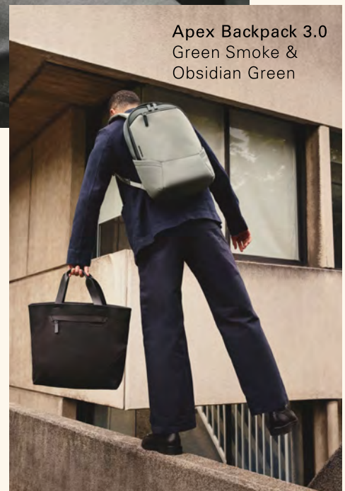
Apex Backpack 3.0 Green Smoke & Obsidian Green

Our Co-Branding Team will help you process orders over 25 units and work with you to create premium custom and co-branded products to represent your brand in a professional and high-quality manner. Sustainability runs through every business decision we make and we're proud to be a B Corp-certified brand and partner with those who share our ethos.