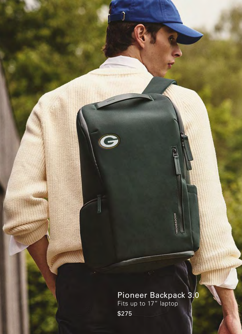
Pioneer Backpack 3.0 Fits up to 17" laptop $275