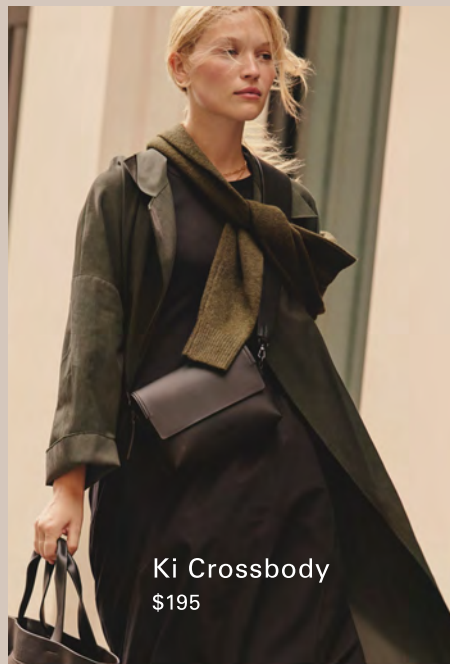
Ki Crossbody $195

Vegan leather trim adds a touch of sophistication, while luggage sleeves make travel effortless. Crafted from waterproof, recycled fabrics, these bags keep you stylish and comfortable all day long.