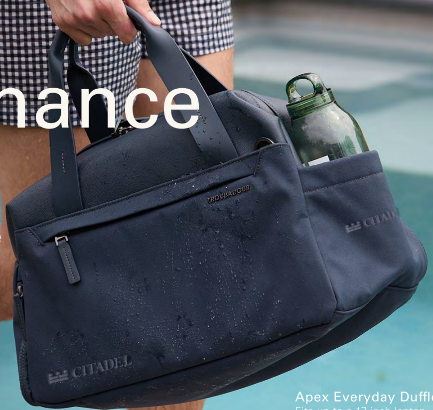
Apex Everyday Duffle

You loved the Apex Backpack 3.0 for its comfort, durability, and organization. Now, we've expanded it into a full collection, each bag crafted with the same tough materials and smart design.