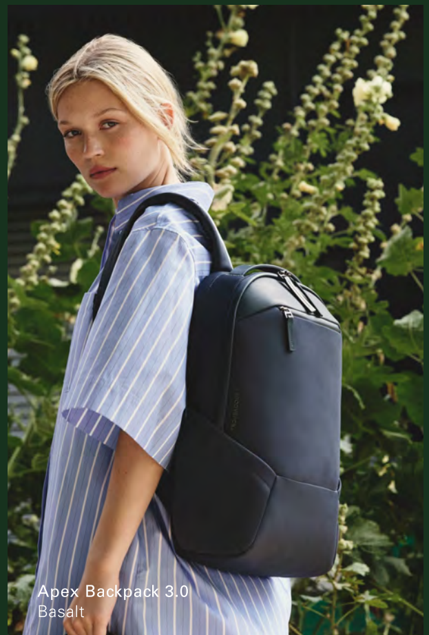
Apex Backpack 3.0 Basalt

We're happy to provide a digital mock-up for personalized orders. Unfortunately, we can't provide physical samples.