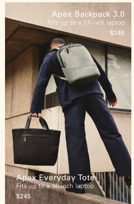
Apex Backpack 3.0