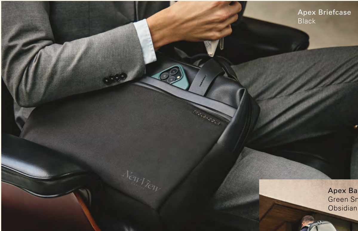
Apex Briefcase Black